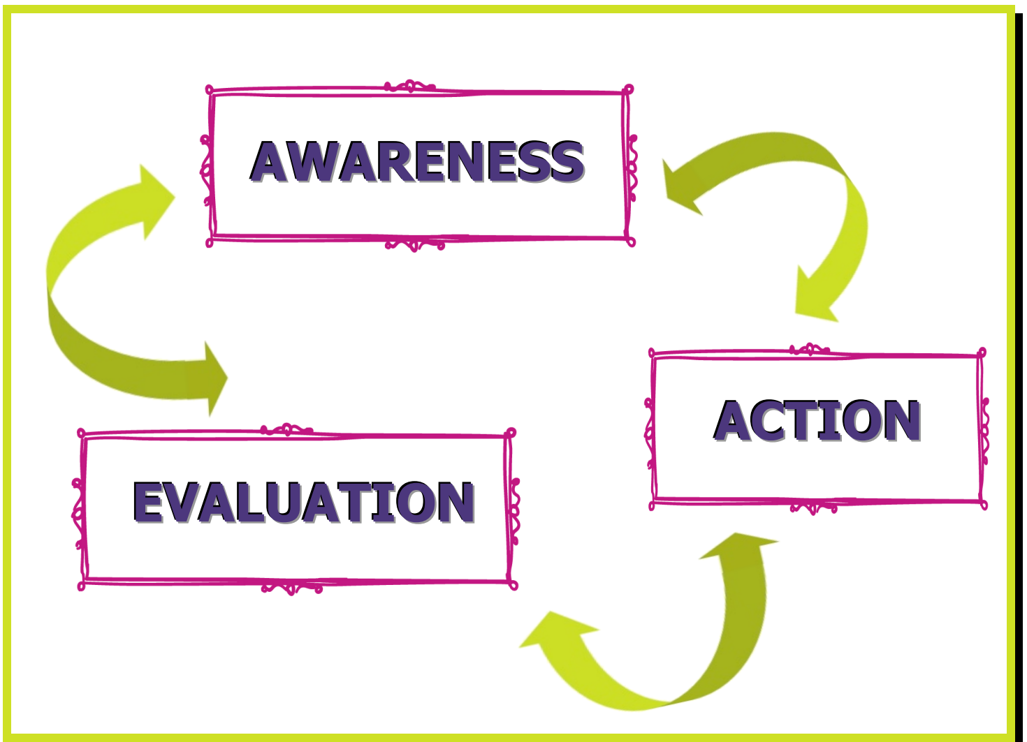
Diagram of Citizenship Model

These three elements interact with each other and form the process by which young people become active and socially aware citizens in their community and in society.